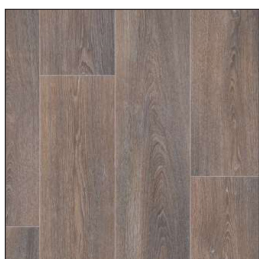
Smoked Oak 100 x 150cm