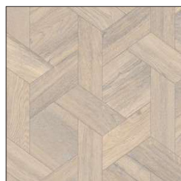
Staccato White Washed 100 x 120cm