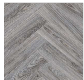
Weathered Herringbone 100 x 120cm