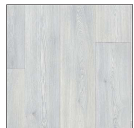
White Washed Oak 100 x 100cm