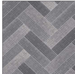
Cadogan Pewter 100 x 100cm