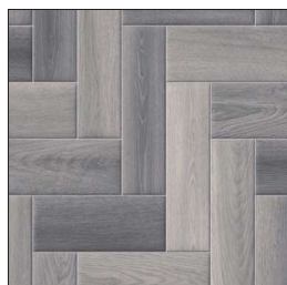
Frozen Parquet 100 x 150cm