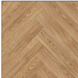
Antique Herringbone 100 x 120cm