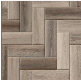
Aged Parquet 100 x 150cm