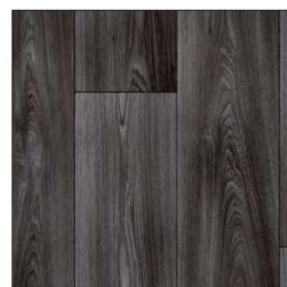
Warm Grey Oak 100 x 150cm