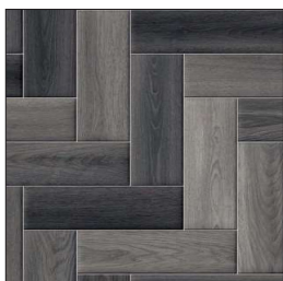
Carbonised Parquet 100 x 150cm