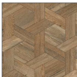
Staccato Smoked 100 x 120cm