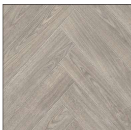
Fossilised Herringbone 100 x 120cm