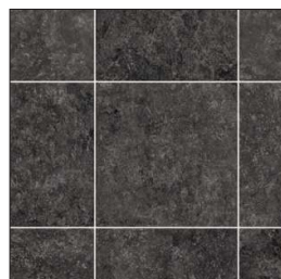
Granite Tile 100 x 100cm