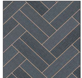
Cadogan Slate 100 x 100cm