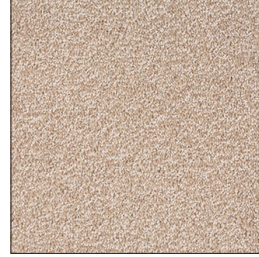
Natural Look 1952