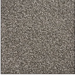
City Break 1958