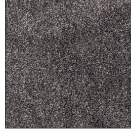
Mid Grey 55924