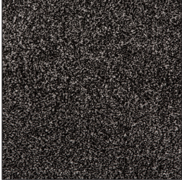
Dark Grey 56588