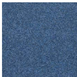
Blue - 586