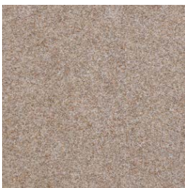
Beige - 153