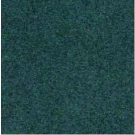
Sage - 6619