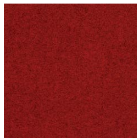
Red - 353