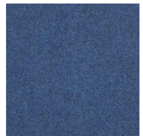
Indigo Blue - 516