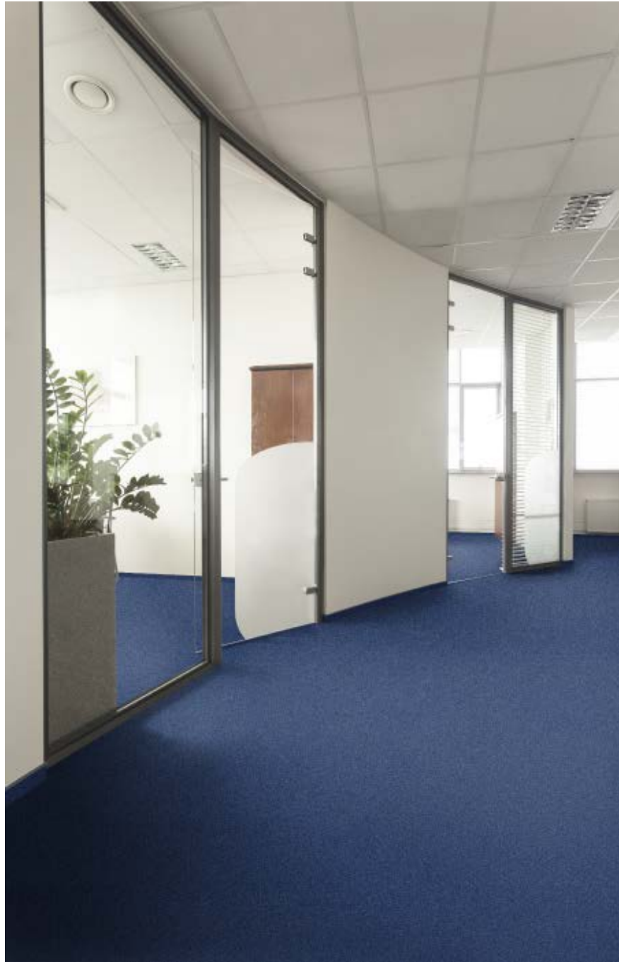
Navy - 507