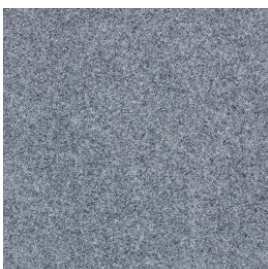
Light Blue - 531