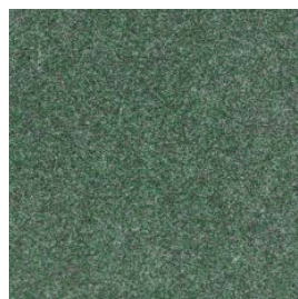
Willow - 627