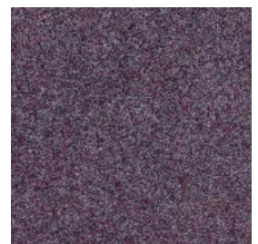
Plum - 3399