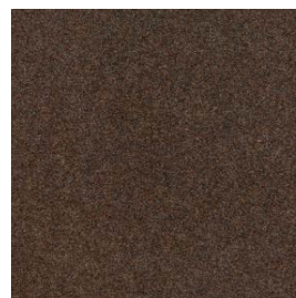
Autumn - 745