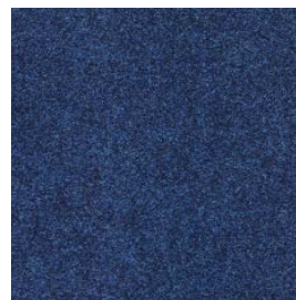
Navy - 507