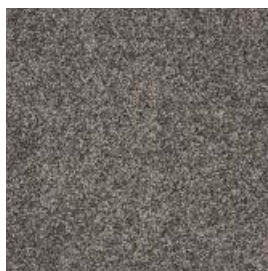
Steel - 74