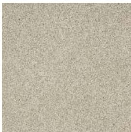
Ivory - 60