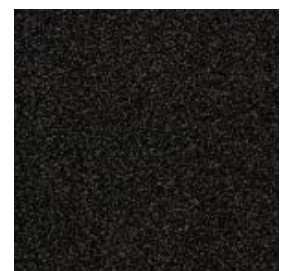
Anthracite - 77