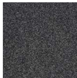
Gun Metal - 78