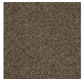
Cappuchino - 90