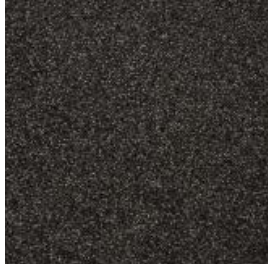
Pewter - 76