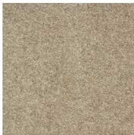
Sand - 69