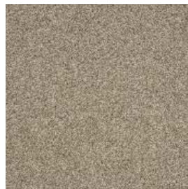
Malt - 70