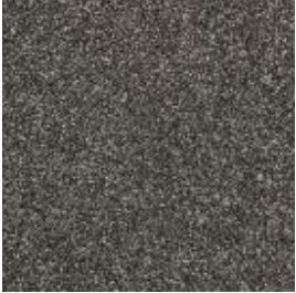
Metallic - 71