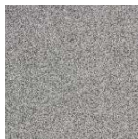
Silver - 73