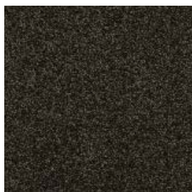
Smoke - 92