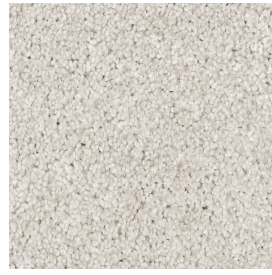
Iced Glass 72