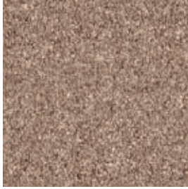
Taupe - 680