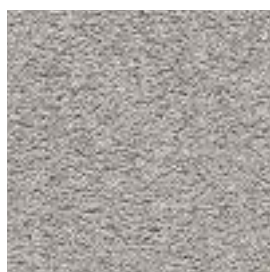
Grey Wood - 920