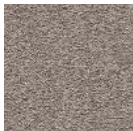
Pine Bark - 820