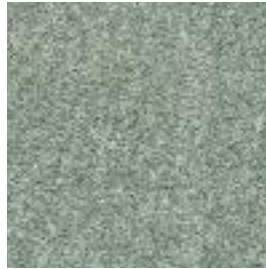
Pale Jade - 450