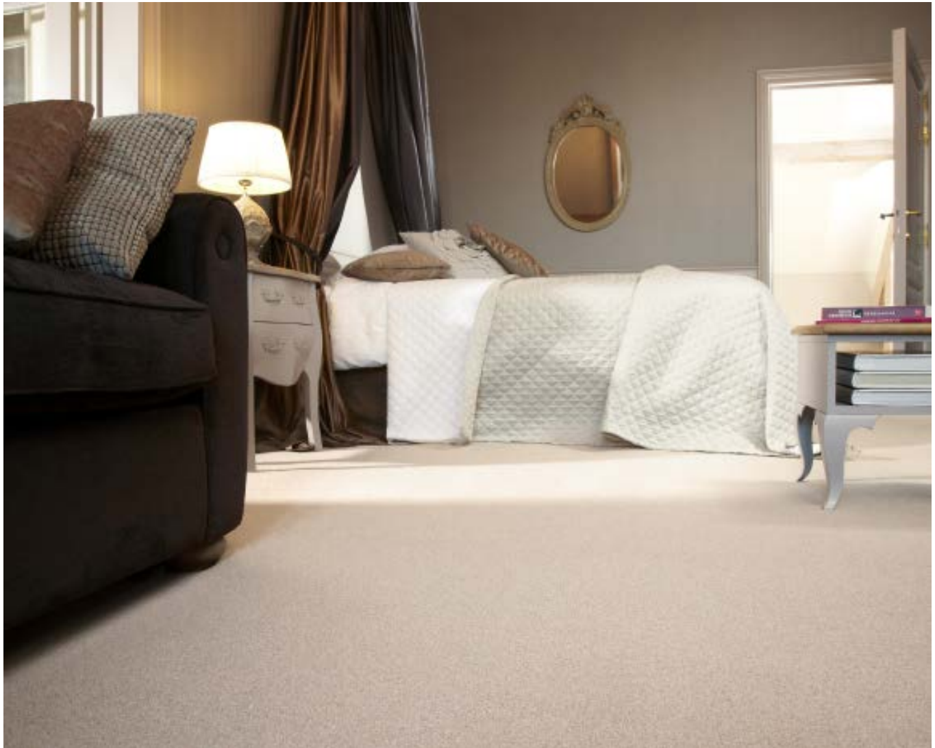
Rope - 650