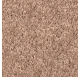
Pale Umber - 810