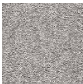
Slate - 950