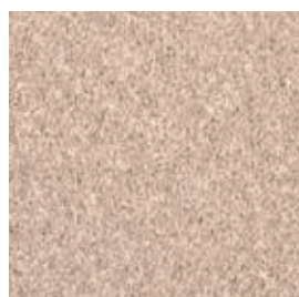
Rope - 650