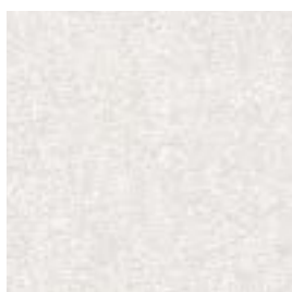
Ivory Pearl - 605