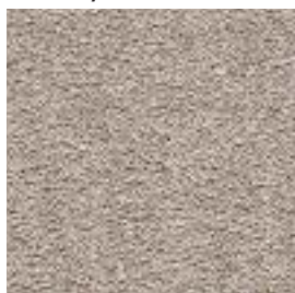
Sandstone - 740