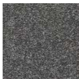
Raven - 980