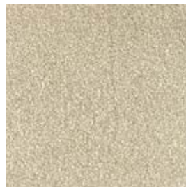
Acanthus Leaf F12