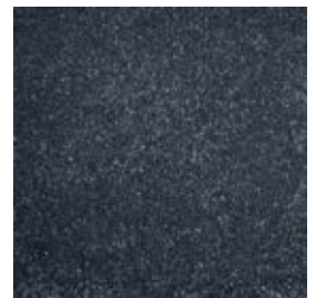
Lock Keeper F30