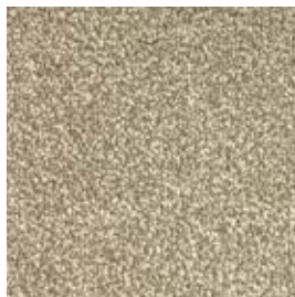
Sloane Square F09