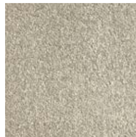
Smithfield Grey F24